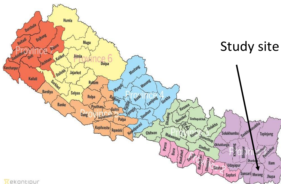
Figure 2: Map of Nepal