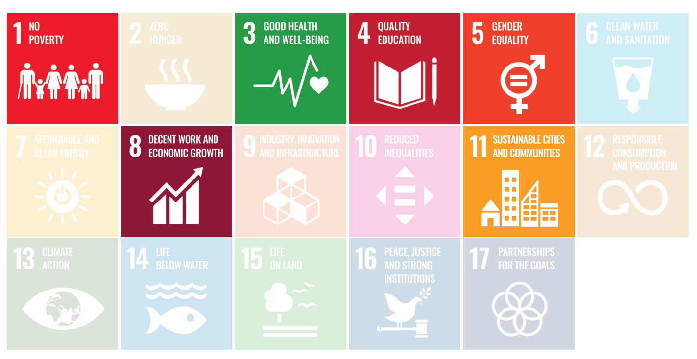
Figure 2: Gender and adolescent-specific indicators are included in SDGs 1, 3, 4, 5, 8 and 11

Exacerbating the challenges around measurement of progress for adolescents is data availability. Country data generated in the 18 gender and adolescent/youth SDG indicators is sparse. Analysis from 2010–2017 found 75% of countries submitting comparable data for 7 indicators and 50%–75% of countries submitting comparable data for 3 indicators. This means the other 8 indicators had less than 50% of countries submitting data (see Figure 3). Troublingly, the percentages of sheer data availability do not take into account the quality of data reported and the extent to which the minimum disaggregation dimensions are being