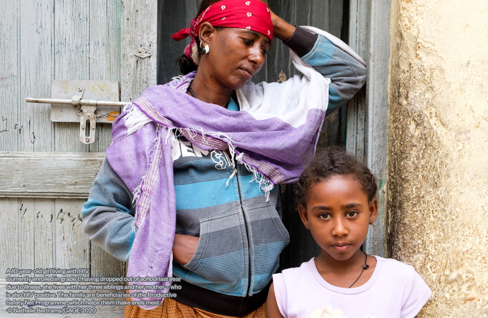
A 10-year-old girl living with HIV. Currently enrolled in grade 1, having dropped out of school last year due to illness, she lives with her three siblings and her mother – who is also HIV positive. The family are beneficiaries of the Productive Safety Net Programme, which helps them make ends meet.

concerted outreach by health workers. A 23-year-old male youth living with HIV in Bahir Dar explained: 'At the beginning many ART users did not receive their medication. However, the health workers made great efforts to link them back telephone communication either with the users or their families ... Besides, ART users are now receiving their medication for six months at once to avoid defaulters. So now, all are receiving their medication.'